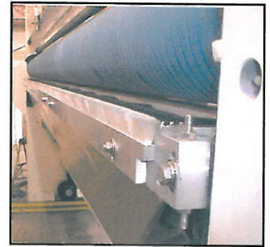
Doyle Systems uses high velocity Air Scrubbing, Dual Brushing and Powerful, High-Pressure Vacuum